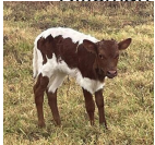
#2444 HR Catch 40 x The Rifleman HR